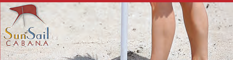
Step 2: Cover the base of the pole with sand.