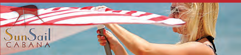
Step 5: Connect the extension pole into the "T" at the junction of the cross bars.